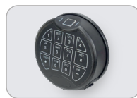
Biometric - Fingerprint Lock