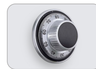
Mechanical Combination Lock

*Dimensions and weights are subject to variations of \pm 5%-10% during manufacturing