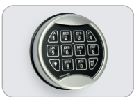
Electronic Encoded Lock